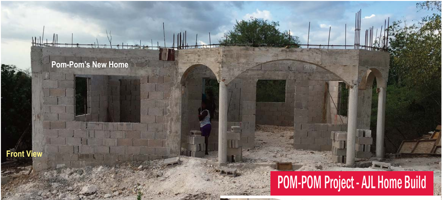
Pom-Pom's New Home