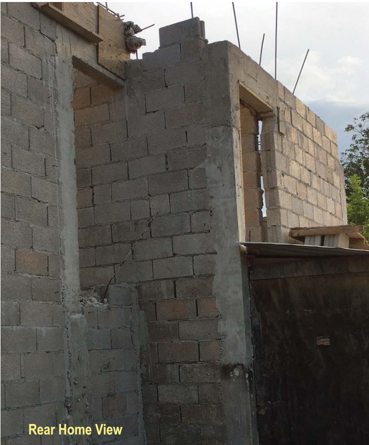
Rear Home View