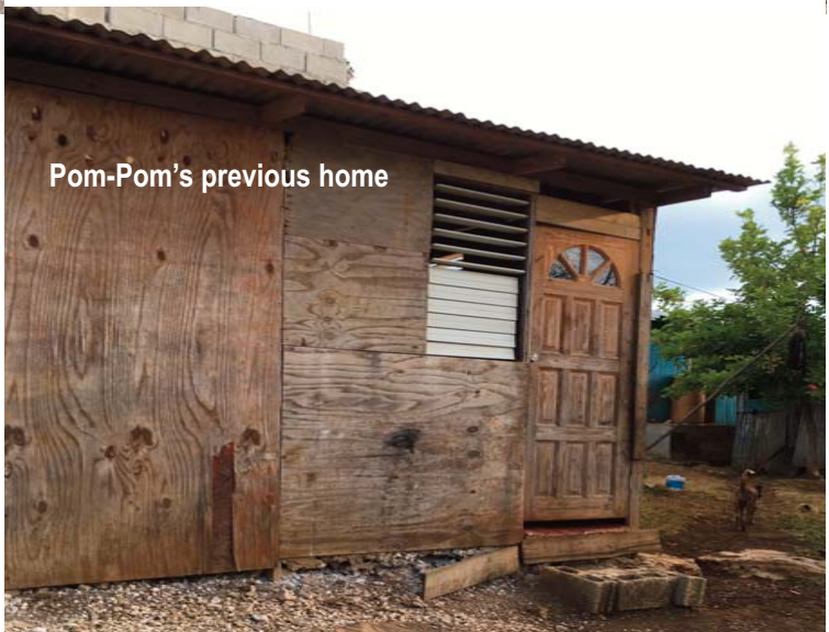
Pom-Pom's previous home