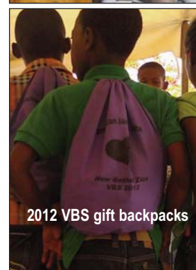
2012 VBS gift backpacks