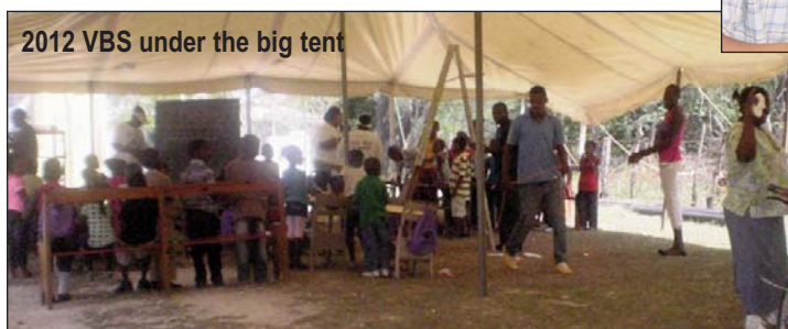
2012 VBS under the big tent