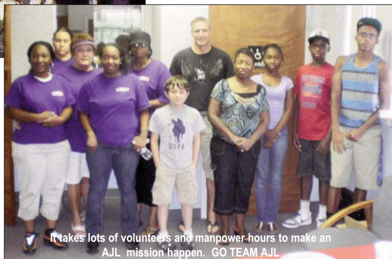
It takes lots of volunteers and manpower hours to make an AJL mission happen. GO TEAM AJL