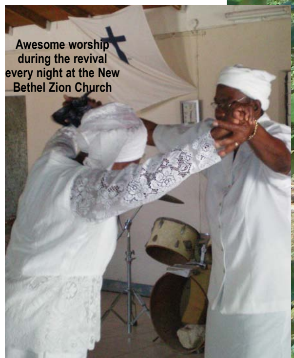
Awesome worship during the revival every night at the New Bethel Zion Church