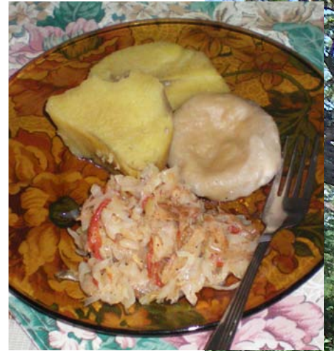
A authentic Jamaican meal of cabbage & salt fish, yams & dumplings. DELICIOUS!