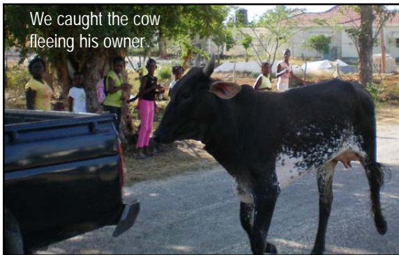
We caught the cow fleeing his owner.