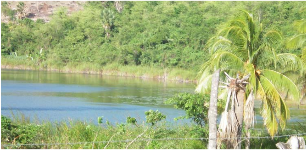
The beautiful lake scenery.